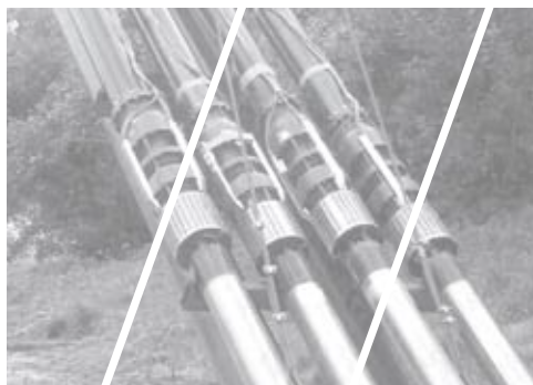
Collection & Distribution

CAPRARI SPA Modena (Italy) • CAPRARI FRANCE SARL Maurepas - Paris (France) • BOMBAS CAPRARI SA Alcalà de Henares Madrid (Spain) • CAPRARI PUMPS (U.K.) LTD Peterborough (United Kingdom) • CAPRARI PUMPEN GMBH Fürth/Bayern (Germany) • CAPRARI PORTUGAL LDA Santarém (Portugal) • CAPRARI PUMPS AUSTRALIA PTY LTD Beverley SA (Australia) • CAPRARI HELLAS SA Thessaloniki (Greece) • CAPRARI TUNISIE SA Ben Arous (Tunisia) • CAPRARI PUMPS (SHANGHAI) CO LTD Shanghai (People's Republic of China) • CAPRARI PUMPS NEW ZEALAND Christchurch (New Zealand)