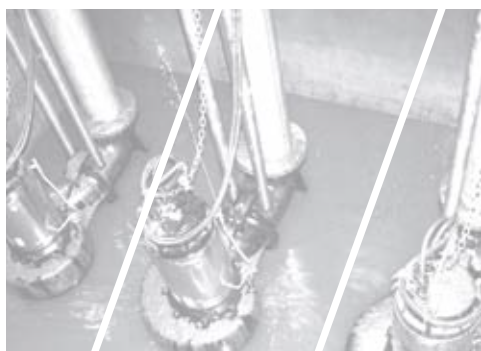
Transport & Treatment