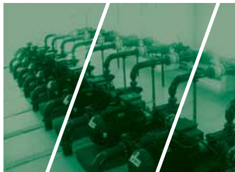
Boosting & Distribution