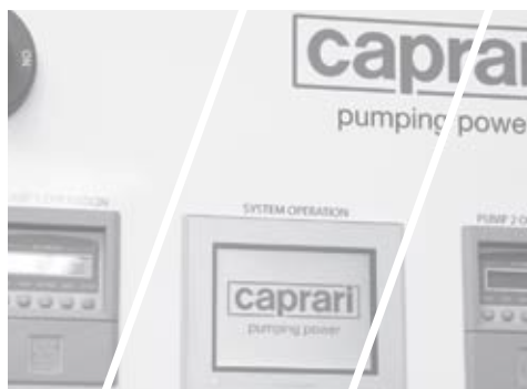
Pump Control Technology