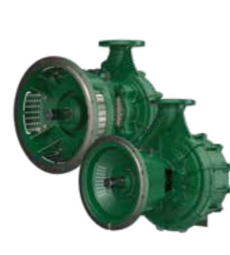
SAE flanged pumps for diesel engines