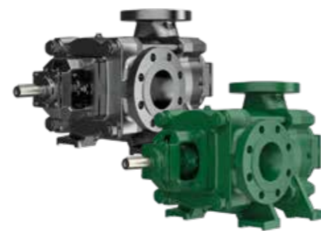
High pressure horizontal multistage pumps