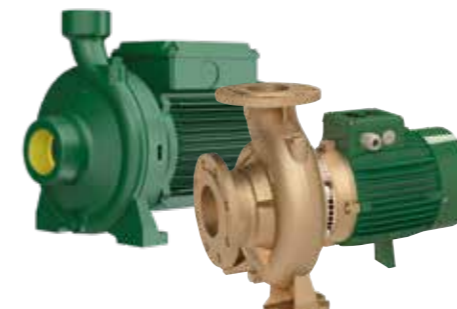
Horizontal monobloc electric pumps