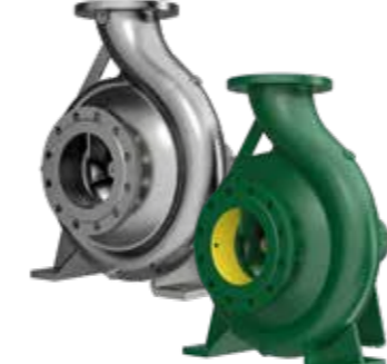
EN733 Normalized pumps