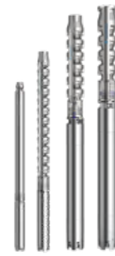
6" ÷ 12" Borehole pumps - ENDURANCE in high precision casted stainless steel