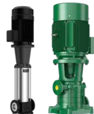
Vertical multistage electric pumps