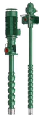
6" ÷ 22" Vertical lineshaft pumps