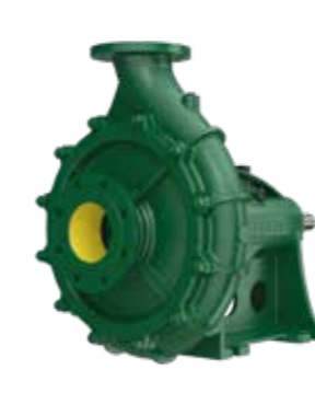
Horizontal single stage pumps