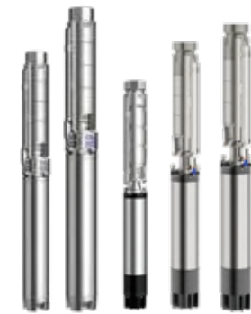
6" ÷ 10" Borehole pumps in stamped stainless steel