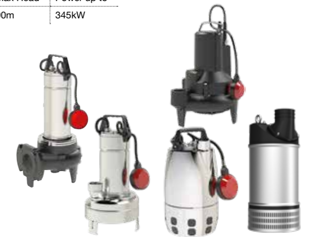
Submersible pumps for drainage and sewage