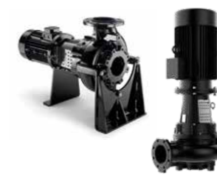
Submersible pumps for wastewater