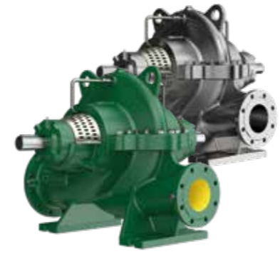
Split case pumps