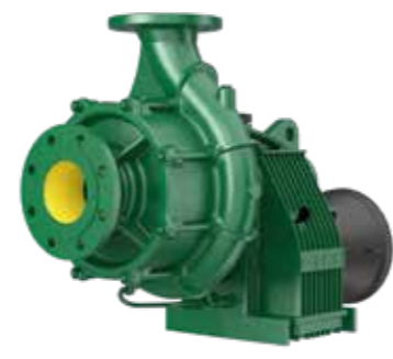
Trailer mounted tractor pumps