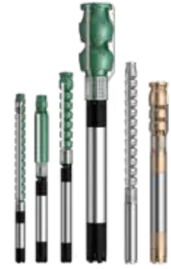
6" ÷ 22" Borehole pumps in cast iron, bronze, stainless steel, duplex and super-duplex